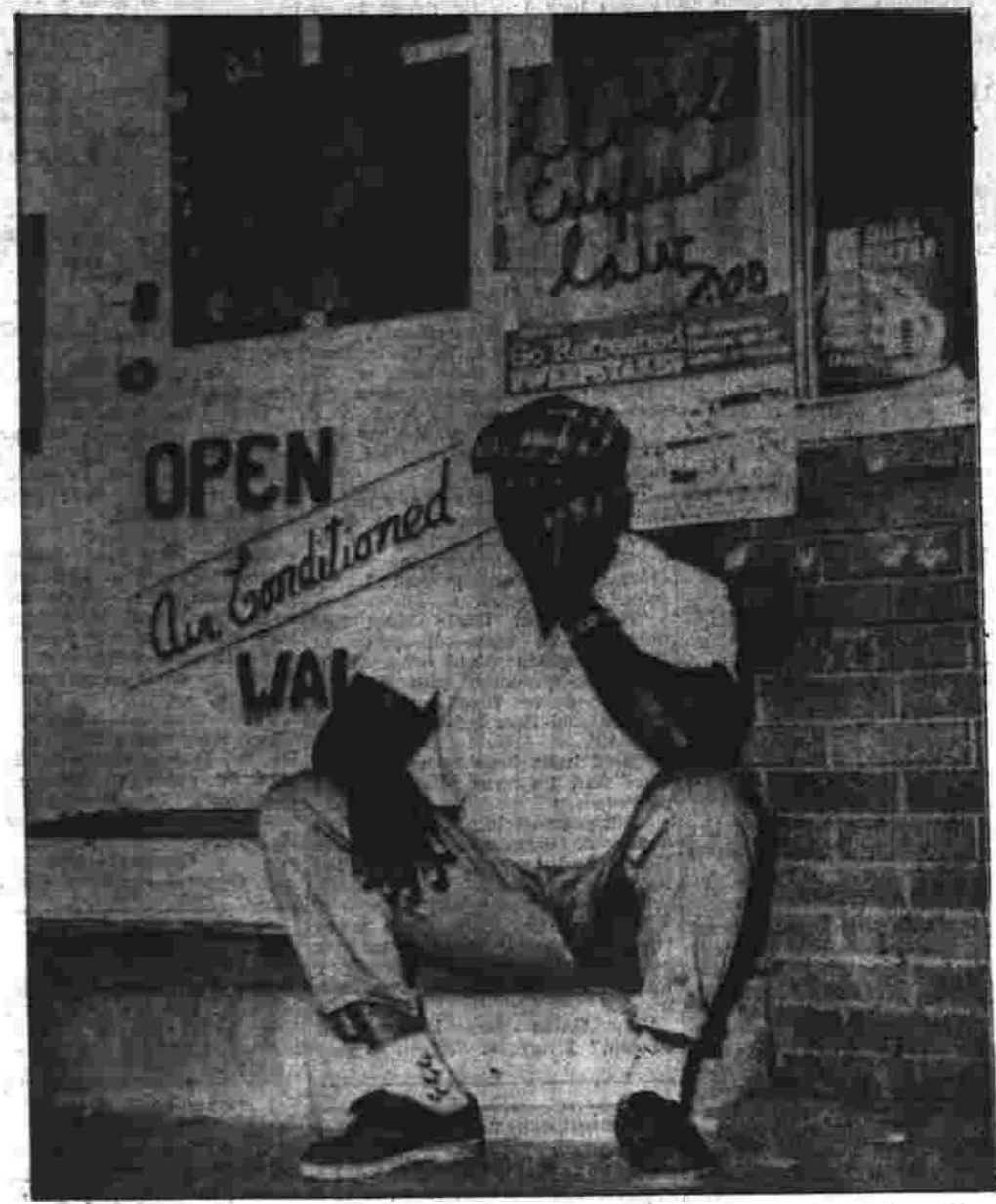
In a somber mood an unidentified Negro sits in front of store closed down by militia law in Cambridge, Md.